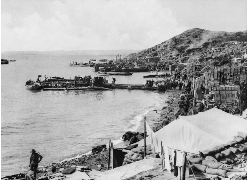
ANZAC Cove, Gallipoli, Turkey, 1915. A view of ANZAC Cove looking north toward New Zealand Point.

The 7 th pushed forward up the left flank of the small strip of beach. The Turks held the high ground and were fiercely protective of their land. They attacked the invaders with a vengeance, mowing down wave after wave of ANZACs as they struggled to cross the narrow beach and scramble up the rugged slopes and out of the line of fire.