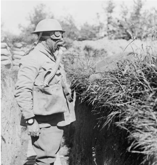
EZ0051. Standing in a trench, an unidentified Australian soldier models the type of gas mask used in the trenches. The wraparound cloth mask featured a carbon filter (in a unit in the bag attached to the soldier's uniform) that removed impurities from the air. Note the fob watch on the soldier's wrist.

They had yet to face the appalling conditions of trench warfare: running the gauntlet of rows of pillboxes, each one bristling with machine-guns; negotiating belt upon belt of barbed wire entanglements, which stretched in a continual line from the English Channel to the Swiss border; and enduring the relentless bombardment and noise of artillery fire—not to mention having to confront death every waking moment.